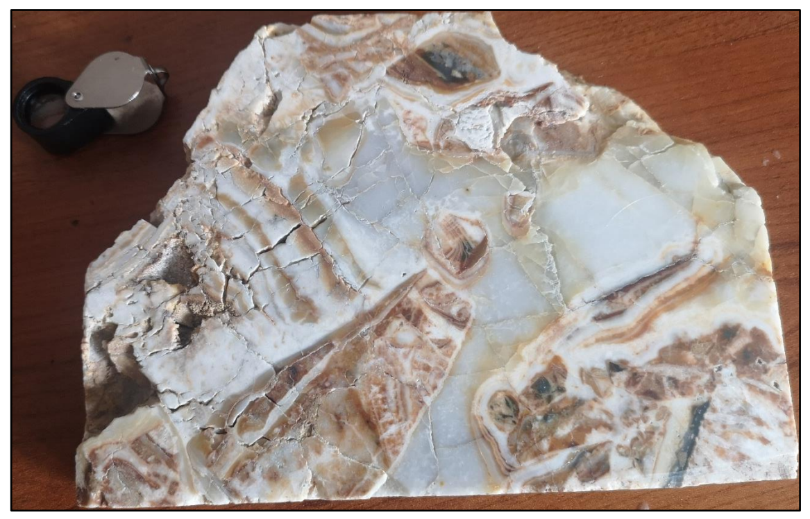
Figure 2. Epithermal chalcedonic silica veining with complex depositional and compositional banding, open space filling and multi-stage brecciation from Mystery property.

Silver Spruce has a 30-day window after signing the LOI to carry out its due diligence and prepare a Definitive Agreement ("DA") for the Property acquisition.