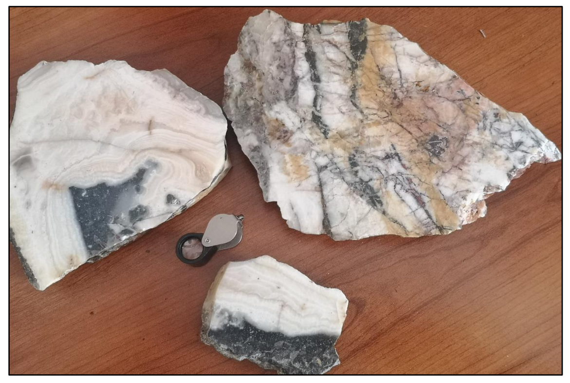
Figure 3. Silica veining with complex deposition as fine laminations to coarse crustiform textures, compositional and textural banding, and multi-stage or episodic brecciation and infilling from Marilyn property.