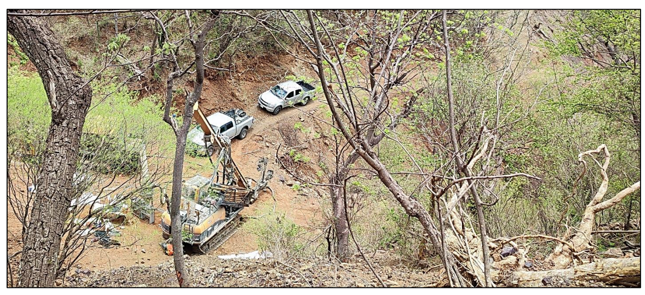
Figure 3. Looking eastward, Minera Drilling on DIA22-10 at PAD #7 above and northwest of the historical mine workings at La Prieta target.

Ten R/C holes were completed at La Prieta, all of which are oriented to intersect depth projections of known surface and shallow underground workings, stockwork zones and traces of surface lineaments associated with mineralized occurrences. The drill holes were inclined between -55° and -75° and drilled to depths ranging from 72 metres to 126 metres.